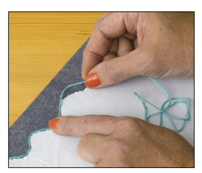
Step 2: Press colorful string into the adhesive to create the