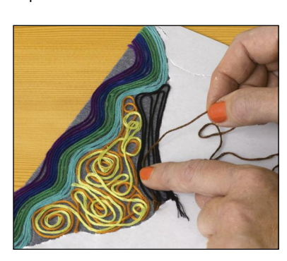
Step 3: Continue cutting away one area at a time and applying string until the piece is complete.