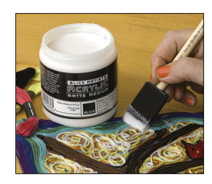
Step 4: Seal the piece with a coating of matte medium.