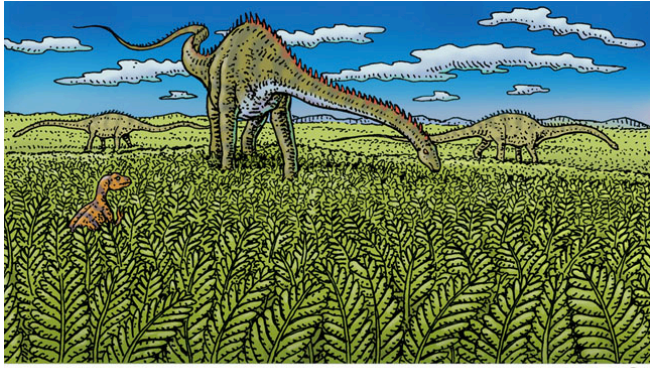
WHAT DID THE BIGGEST HERBIVORES OF ALL TIME EAT?